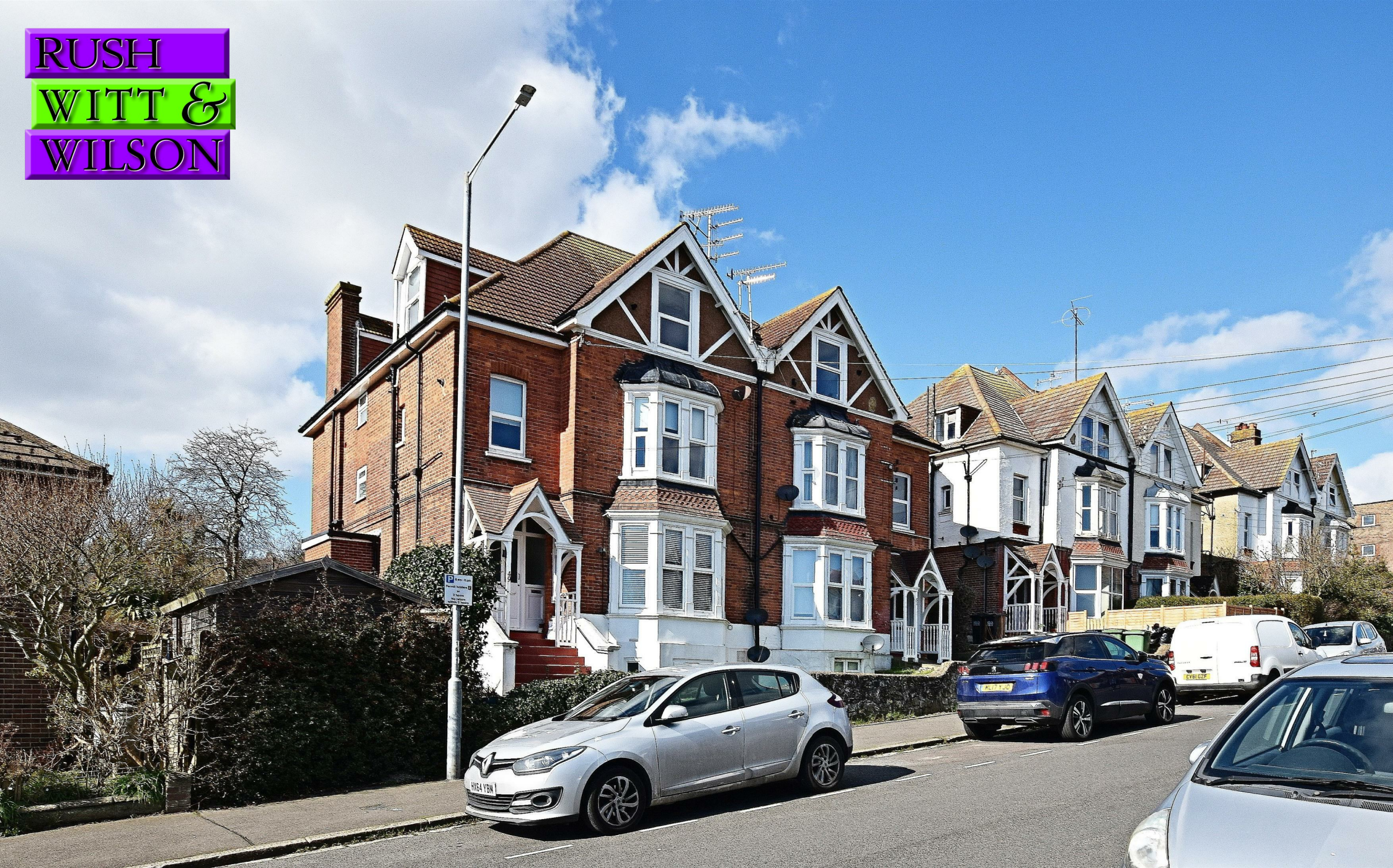
49d Manor Road, Bexhill-On-Sea, East Sussex TN40 1SN £196,000